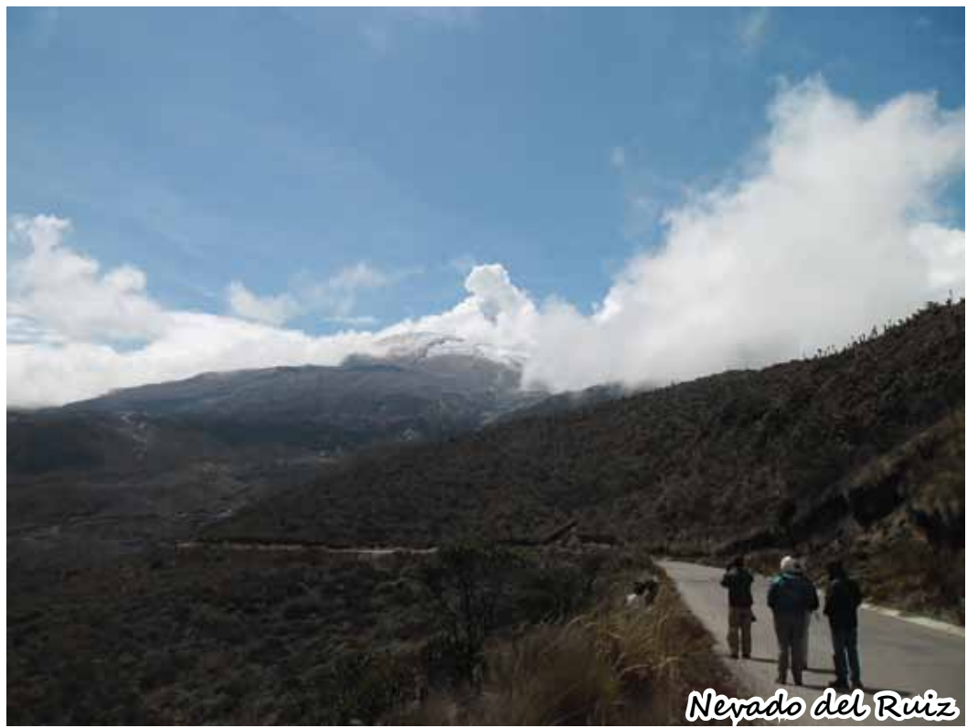
Nevado del Ruiz

Andean Emerald x Speckled Hummingbird x Fawn-breasted Brilliant x Buff-tailed Coronet x Green-crowned Woodnymph x Wedge-billed Hummingbird x Purple-throated Woodstar x Collared Trogon x Crested Quetzal x Red-headed Barbet x Crimson-rumped Toucanet x Golden-olive Woodpecker x Smoky-brown Woodpecker x Azara's Spinetail x Red-faced Spinetail x Linneated Foliage-gleaner x Streaked Xenops x Montane Woodcreeper x Uniform Antshrike x Plain Antwreio x Nariño Tapaculo x Variiegated Bristle-Tyrant x Golden-faced Tyrannulet x Great Kiskadee x Grey-capped Flycatcher x Golden-crowned Flycatcher x Green-and-black Fruiteater x Barred Becard x Blue-and-white Swallow x Gray-breasted Wood-Wren x Chestnut-breasted Wren x Andean Solitaire x Black-billed Thrush x Glossy-black Thrush x Flame-rumped Tanager x Blue-gray Tanager x Palm Tanager x Blue-capped Tanager x Blue-winged Mountain-Tanager x Multicolored Tanager x